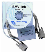
Optional isolated RS232 communication interface and VEBat software (for BMV 602 and 602H)